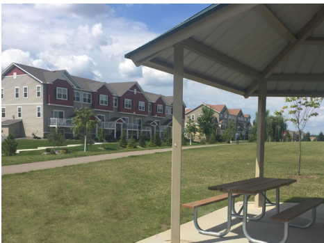
Townhomes Fronting Pioneer Pass Park