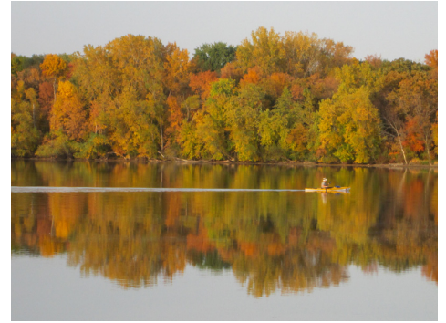
Fall Kayaking on Lake Ann

As a supplement to this document, a Park System Inventory was completed that takes stock of the system's existing amenities.