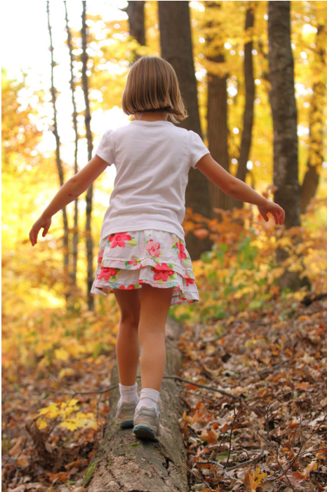
Girl walking on tree at the Arboretum

“ Keep up the great work and enhance our parks; one of the main reasons we live here.”