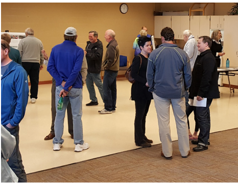
Open House Participants