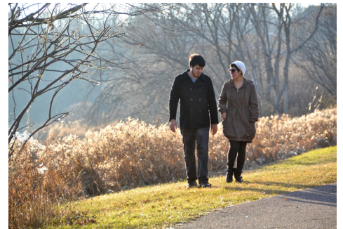
Son & daughter walking at the Arboretum